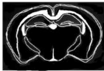
Region # 8