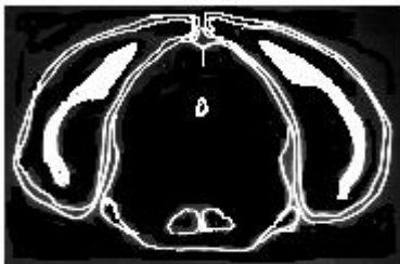
Region # 10