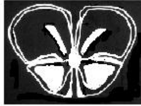
Region # 2