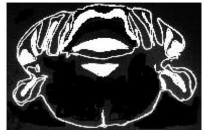
Region # 12