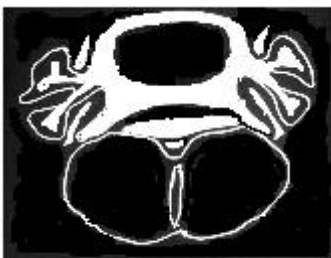
Region # 13