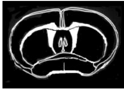
Region # 5