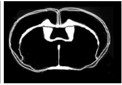
Region # 6