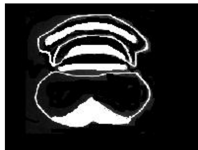
Region # 14