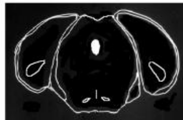
Region # 11