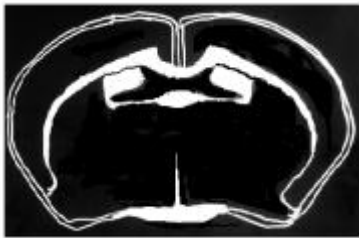
Region # 7