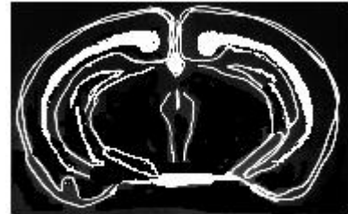
Region # 9